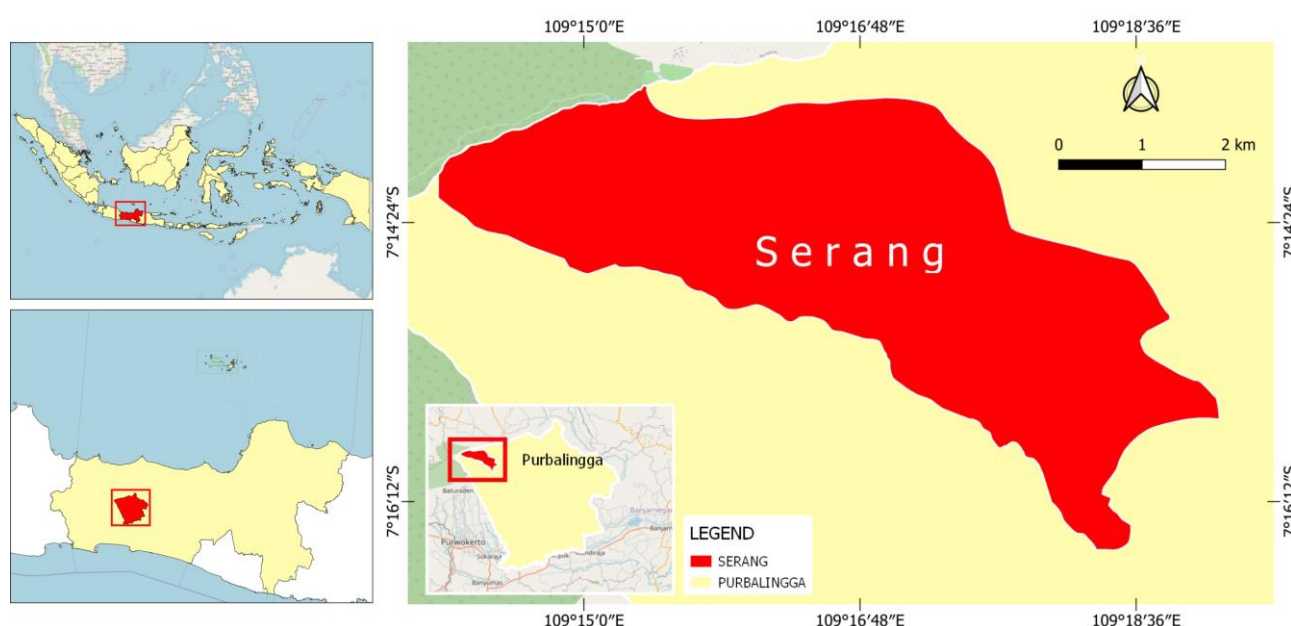
Figure 1. Study area map showing the location of the research site in Central Java, Indonesia

Where, E is the Evenness index, H' is the Shannon-Wiener diversity index and S is the total number of wild bee species.