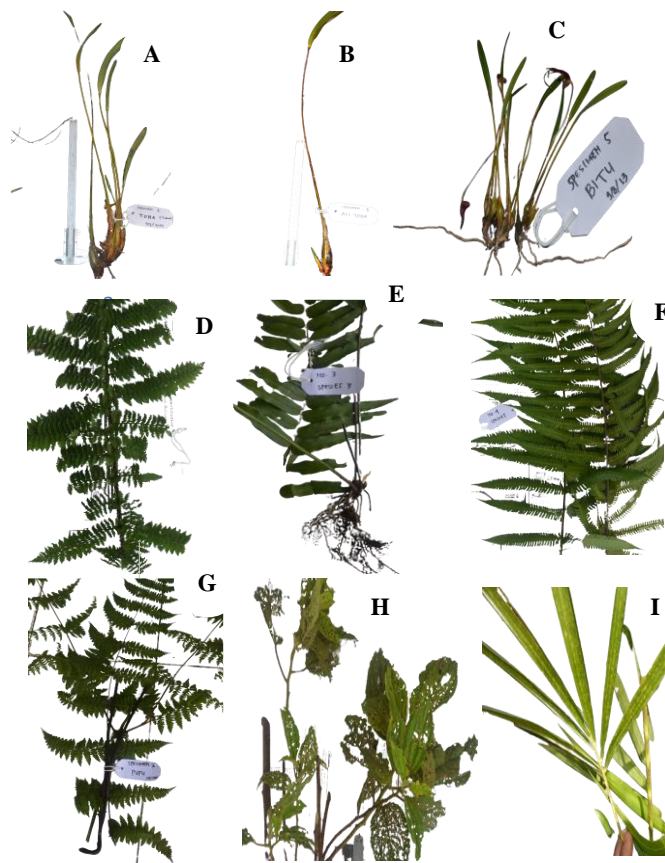
Figure 2. The plant species used as raw materials for orchid noken manufacture are based on Mee's local wisdom. A. Dendrobium aff. Centrale , B. Dendrobium aff. Regale , C. Dendrobium sp. section Diplocaulobium , D. Cyathea containinans , E. Nephrolepis sp., F. Dryopteris hirtipes , G. Dicranopteris linearis , H. Pipturus argenteus , I. Calamus sp.

Rattan stalks are prized for their strength, flexibility, and uniformity, making them commercially valuable for furniture and handicrafts (Myers 2015; Mairida et al. 2016). Calamus sp., a specific rattan genus, has long been used as a raw material for handicraft production (Talukdar et al. 2021). The distinct patterns created with rattan are employed explicitly in making this type of noken , distinguishing it from other noken varieties found in the daily lives of the Mee people and other Papuan Tribes. Calamus sp. naturally grows in primary and secondary forests, shifting cultivation areas, and scrublands around the dwellings of the Mee Tribe.