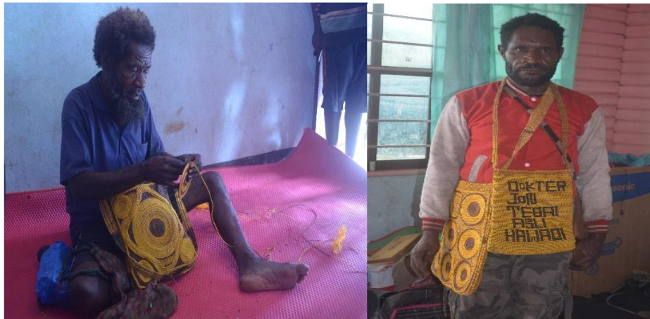
Figure 4. Mee Artisans and the handicraft of orchid- noken in Bomomani Village, Dogiyai District, Papua Province, Indonesia. A. The Mee men artisans make a circle motif, part of the orchid- noken body ( agiya kebone ), B. Male artisans of the Mee Tribe use their artificial orchid- noken ( toha agiya )

The making of noken by Mee men also reflects their cultural values and identity. Noken is an integral part of the daily life of the Mee Tribe and other Papuans (Kanem and Norris 2018; Wahyudi et al. 2023). It is used for various purposes, such as carrying goods, transporting agricultural products, or as part of traditional clothing (Risamasu et al. 2019). Mee men understand the meaning and symbolic value of noken in their cultural context, and they are proud to preserve this tradition by crafting noken . In addition, making noken also provides an opportunity for Mee men to generate income. Throughout Papua, noken is a cultural product that can potentially boost people's economies (Risamasu et al. 2019; Avianto et al. 2021). Noken has become a vital handicraft industry for the Mee Tribe, and Mee Tribe men are involved in producing orchid- noken for sale in local markets and outside their area. With their skills in making noken , the men of the Mee Tribe can act as artisans and entrepreneurs, thus strengthening their community's economy.