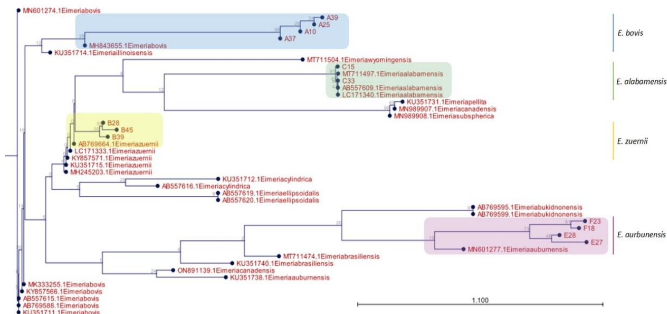
Figure 2. Phylogenetic analyses of pathogenic Eimeria spp. Sequences from the present study and other relevant sequences. The phylogenetic tree was constructed based on partial sequences of ITS-1 by CLC sequence viewer version 8.0.

According to the age of the host, calves aged less than one year (90.0%) were more prone to Eimeria infections than that young (66.7%). Least infections were found in adults over two years old (16.4%). Additionally, we separated the host's age into three categories: calves (under 1 year old), between 1 and 2 years old, and over 2 years old. The most frequent Eimeria species in each age range of hosts was Eimeria bovis , while the least frequent was E. alabamensis (Table 2). The phylogenetic analysis revealed that pathogenic Eimeria species from Indonesia were grouped with sequences from Eimeria species from various geographic origins in the same clade (Figure 2).