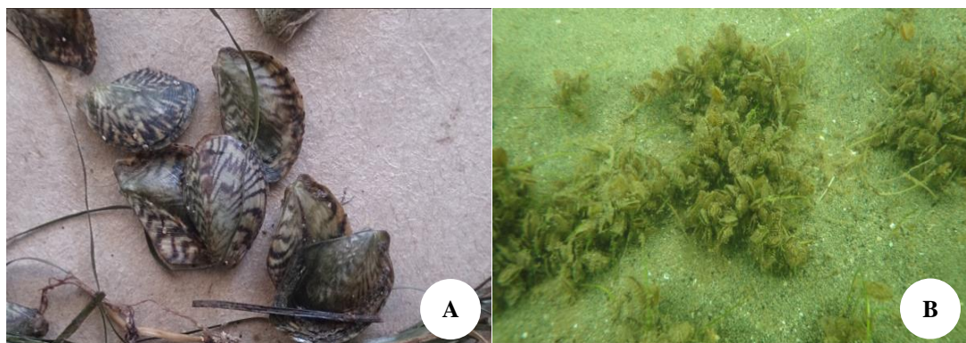
Figure 3. A. Zebra mussel Dreissena spp.; B. Mussels attached to seagrass leaves and rhizomes

Epiphytes are organisms that only attach to plant surfaces, such as the leaves and rhizomes of seagrasses. It was reported that the presence of epiphytes on seagrass leaves could prevent nutrients from being absorbed, reducing the productivity of the seagrass. This happens if the main predators of the epiphytes are absent or very few, and there will be a build-up of epiphytes on the seagrass leaves, thereby hindering the process of photosynthesis and growth of the seagrass (Mabrouk et al. 2014). In contrast, some epiphytes on leaves have also been shown to be beneficial to seagrasses by increasing the amount of bioavailable inorganic nitrogen through mineralization of dissolved organic nitrogen deposited by microorganisms on the leaf surface, thereby increasing the productivity and growth rates of seagrass as a host for the epiphytes (Tarquinio et al. 2018). Macroalgal also plays a role in influencing seagrass cover, but the percentage of macroalgal cover at the three study sites (Anugrah, Penyulingan, and Katoang cays) was relatively low (around 3%, 4% and zero, respectively) as seen in Table 1. Despite their limited growth at these sites, benthic macroalgae should be able to grow well because they only require 8-10% light penetration (Choice et al. 2014).