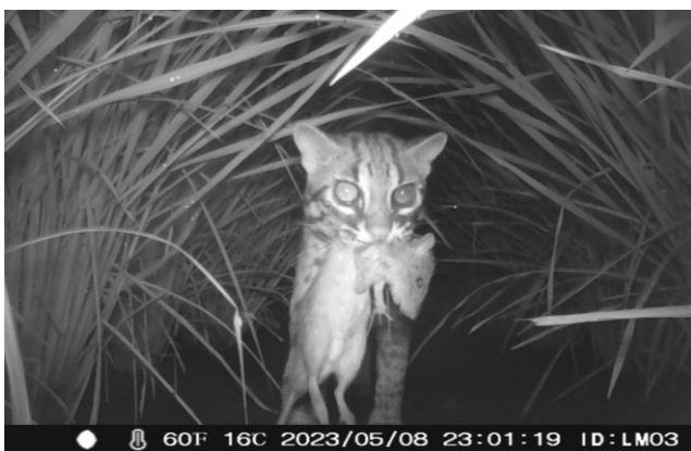
Figure 2. Sunda leopard cat carrying rice field rats among rice plants in Nagari Batu Taba