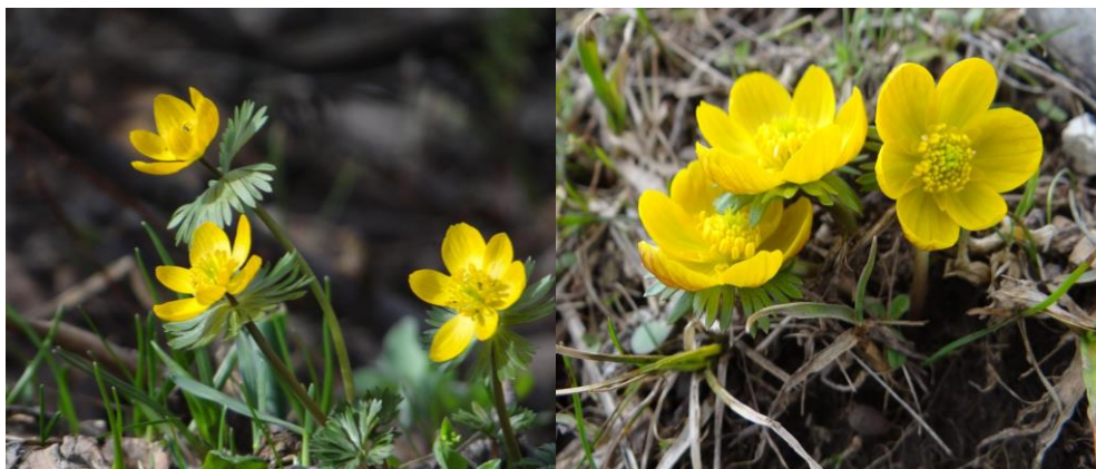
Figure 1. Eranthis longistipitata in the natural habitat in the Kazakhstan portion of western Tien Shan (Aksu Jabagly State Nature Reserve)

The samples were pretreated with 2% alkali solution for 5-10 minutes with constant shaking and washed thoroughly with running tap water to remove the superficial dust particles as well as fungal and bacterial spores. They were then sterilized twice with sterile double distilled water and by 0.1% solution for 5 min of the fungicide "Prosaro" (Bayer CropScience Ltd, UK) inside the Laminar Air flow chamber. After sterilization, the seeds were exposed to 0.1% AgNO 3 solution for 1.5-3 minutes. Then, the seeds were immersed and rinsed two times in autoclaved distilled water to remove the growth inhibitors and to hasten the germination process (Gupta et al. 2020). The ability of seeds to remain viable for a long time and not proceed to germination is one of the most important adaptive properties of plants. In general, representatives of the Ranunculaceae family are characterized by a morphophysiological type of rest associated with underdevelopment of the seed embryo (Forbis and Diggle 2001). Cold stratification treatment was used to overcome seed dormancy in E. longistipitata seeds. The seeds were stratified by putting them in refrigerator (5±1°C per 14 days) and control seeds (stored at room temperature and dry conditions for same period).