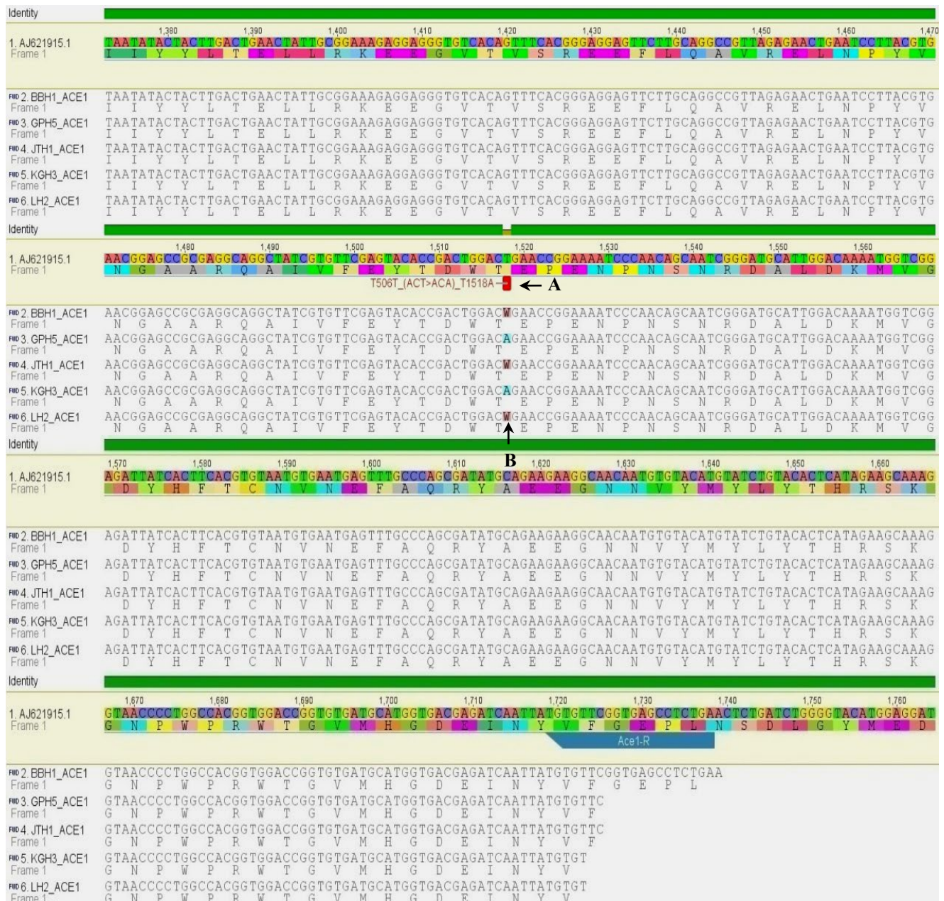
Figure 2. Alignment of Ace-1 gene sequences (GP, JT, KG, LM and BB population). The sequence of five populations were aligned with the Ace-1 gene (GenBank accession no. AJ621915.1) (A) Novel mutation occurred in T506T location. (B) Point mutation occurred as substitution in the third nucleotide (ACT>ACA) without altered the amino acid translation

Across the five populations a greater frequency of the TT allele was found in tolerant (34.72%) than in resistant (30.43%) Ae. aegypti . While the TA allele dominated in resistant (15.22%) rather than in tolerant populations (10.87%), the AA, allele frequency was the same across both phenotypes (4.35%) (Table 3).