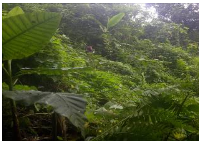
Figure 5. Location of hunting in primary forest