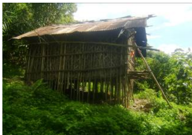
Figure 6. Huts resting place in the forest