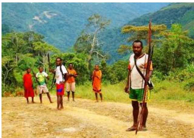
Figure 3. Sigim and Sinatousi community hunting tools in Arfak Mountains, West Papua, Indonesia