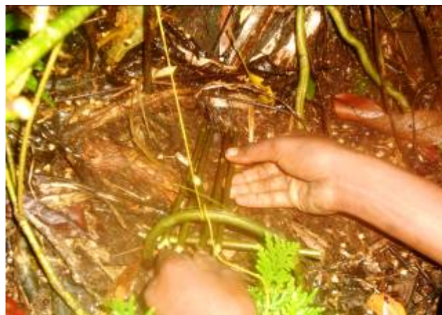
Figure 4. Model of traditional Wattled Brushturkey snares tool in Arfak Mountains, West Papua, Indonesia