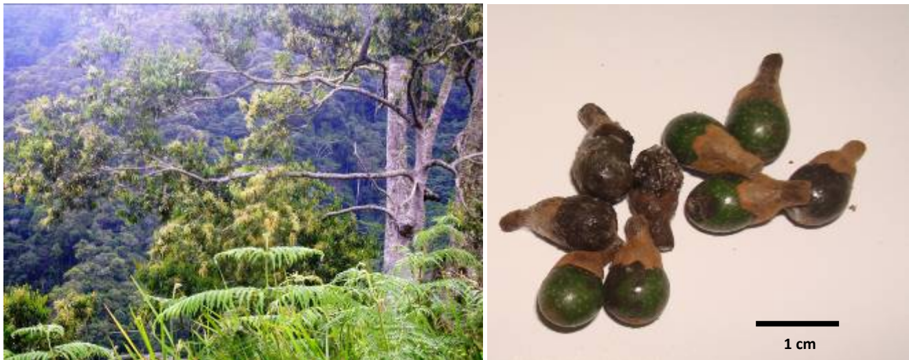
Figure 2. Flower and fruit of Litsea tree ( Litsea ledermanii )

The villagers of Sigim and Sinaitousi hunt Wattled Brushturkey for their own consumption. According to Thomas (2010), wildlife poaching in the New Guinea region (Island of Papua) is one of the most important activities for indigenous people's livelihood as it provides most of the animal protein for the family.