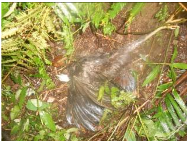
Figure 7. Trapped bird of Wattled Brushturkey