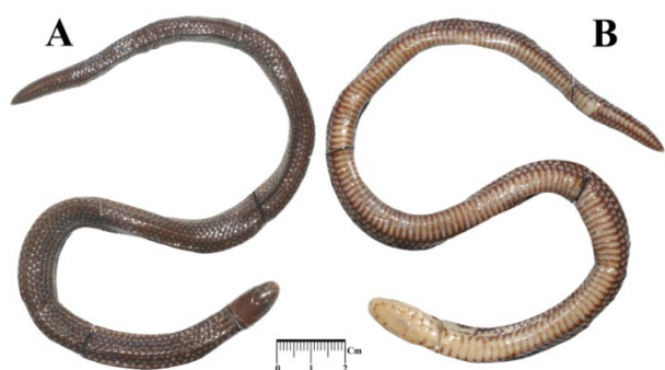
Figure 3. The upper side (A) and under side (B) body of C. melanota (MZB.Ophi.3129) from the Karimunjawa Island, north of Java, Indonesia. The first three scale rows and ventral scales show the characteristics of this species.