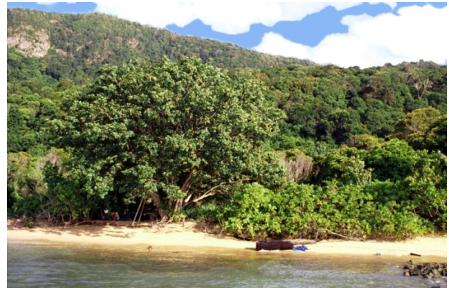
Figure 1. Coastal forest of Legon Moto in the Karimunjawa Island, Java Sea, Indonesia which discovery habitat of C. melanota

Karimunjawa Island is a part of the Karimunjawa Islands which is located in the Java Sea at 5°40' 39"-5°55' 00" latitude and 110°05' 57"-110°31' 15 " longitude. The location is within the administrative region of Jepara District, the Province of Central Java, Indonesia and situated about 60 nautical miles north of Semarang, the capital city of Central Java, Indonesia (Figure 2).