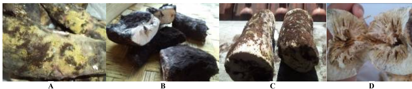
Figure 2. Dominant unwanted microbial strain on the cassava tuber, i.e., Trichoderma sp. (A), Aspergillus niger (B and C), rotten cassava caused by yeast during solid state fermentation (D)