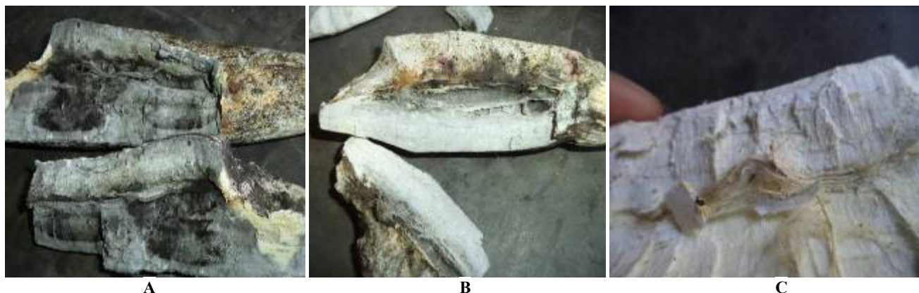
Figure 1. Fermented dried cassava ('gatotan') with black (A), patchy grayish black (B) and white color appearance (C) in the tuber

The dominant indigenous microbe during 'gatotan' fermentation were fungi. Isolation and identification of indigenous fungi were based on the different color of mycelia and sporangium on morphological characterization. There were four isolates as the most dominant fungi in the 'gatotan'. The fungi isolates were coded as isolate 1, 2, 3, and 4 (Figure 3). The characterization of the dominant indigenous fungi was observed under the binocular XSZ-107 microscope (Figure 4).