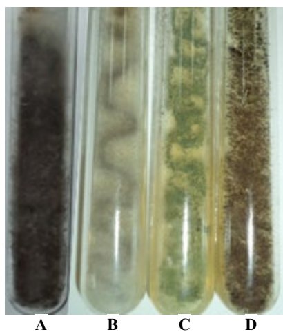
Figure 3. Isolates of the indigenous dominant fungi from “gatotan”

Fungus isolate no. (1) had very fine and greyish white of mycelia color on MEA plate which subsequently turned black when it mature based on the macroscopic observation. During incubation, the pycnidia were found (Figure 4.A1). The pycnidia were a round or bottle fruit body form that containing conidia. Based on the microscopic observation, this fungi had septate hyphae. When the pycnidia were open, the conidia (spore) would be spread. The conidia were observed using microscope at 400x magnification (Figure 4.B1). This fungus was identified as B. theobromae , which had the same characteristic as reported by Yan et al. (2013). Purwandari (2000) also observed the presence of B. theobromae in the ‘gatotan’. The hyphae were penetrated to the cassava tuber and made tuber’s appearance become greyish in the inside and outside of cassava tuber.