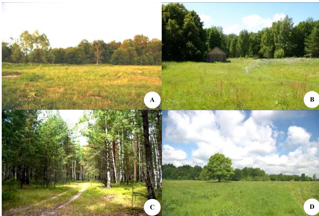
Figure 2. Typical biotopes of the Mordovia State Nature Reserve, Russia. A. Floodplain meadow (cord. Plotomoyka, author: G.B. Semishin); B. Meadow (cord. Inorskiy, author: G.B. Semishin); C. Glades in a mixed forest (quar. 420, author: G.B. Semishin); D. Floodplain meadows with adjacent oak forest (quar. 376, author: O.N. Artaev)

From the north the border runs along the Satis river-the right tributary of the Moksha, further to the east along the Arga river, which flows into the Satis river. The western border runs along the rivers Chernaya, Satis and Moksha. From the south the forest-steppe approaches naturally delineating the boundary of the reserve massif. By natural zoning the forest tract of the Mordovia State Nature Reserve belongs to the zone of coniferous-deciduous forests on the border with the forest-steppe. Forest communities occupy 89.3% of the total territory. In general, the vegetation cover of the Mordovia State Nature Reserve has a taiga character with a definite gravitation towards a nemoral complex during successions. The participation of forest-steppe elements is typical for this territory. Pine ( Pinus sylvestris L.) is the main forest tree in the Mordovia State Nature Reserve. It forms pure or mixed plant communities in the southern, central and western parts of the Mordovia Reserve. Birch ( Betula pendula Roth) forests occupy the second place in the forest area of the Mordovia Reserve. These are predominantly secondary communities at the sites of cut and burnt pine forests. Especially a lot of young birch forests are at places damaged by wildfire in 2010. Lime ( Tilia cordata Mill.) forests are located mainly in the northern part of the Mordovia State Nature Reserve. These are secondary plant