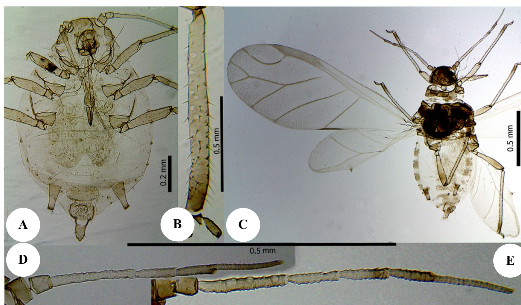
Figure 2. Aphis passeriniana (Del Guercio): A. Apterous viviparous female, B. Hind tibia of intermediate individual between apterous and oviparous female, C. Alatae viviparous female, D. Six-segmented antenna of apterous viviparous female, E. Six-segmented antenna of alatae vivipara