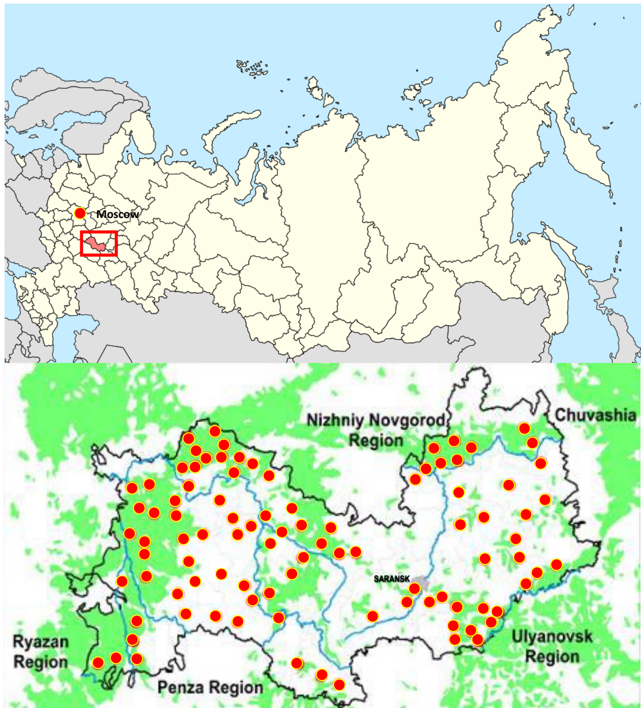
Figure 1. Study sites of click beetles in the Republic of Mordovia in 2006-2017 (red dots)

There are given references to the literature on the species from the territory of Mordovia (in case there is a reliable indication of the point of discovery it is mentioned either), new collection sites (previously unpublished information), collection date, number of collected specimens, surname of the collector, notes (if any) for each species in the annotated list below. In the absence of new unpublished material of the authors, the section "Material" is not given in the article.