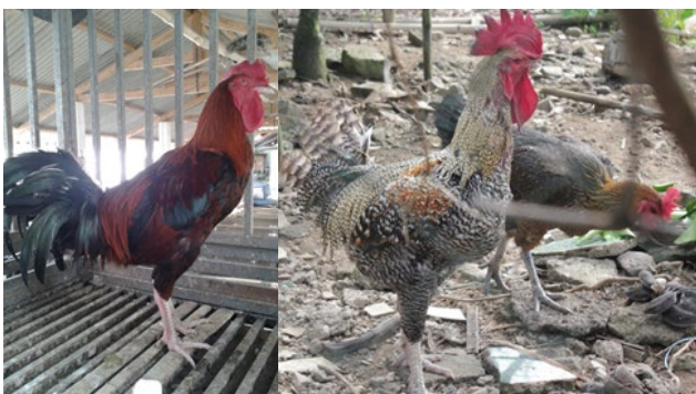
Figure 1. Pelung chickens

The research was carried out in areas where Pelung chickens were majority kept. The areas were Garut, Bandung, Cianjur and Sukabumi Districts, West Java Province (Figure 2). Garut District is situated 64.2 km from Bandung City, the capital of West Java Province. The district is adjacent with Bandung District, and it is located at an altitude of 100-1500 m asl with mean annual rainfall of 2,589 mm and annual temperature 24-27°C (Dinas Komunikasi dan Informatika Kabupaten Garut 2017). Bandung District is a highland area with annual rainfall of 1,500-4,000 mm and annual temperature between 12-24°C. The district is adjacent with the capital of West Java Province (Pemerintah Kabupaten Bandung 2017). Two other areas, Cianjur and Sukabumi Districts, are located in southwestern of Java Island. Both districts are adjacent. Cianjur District is situated at an altitude of 7-2,962 m asl with mean annual rainfall of 2,610 mm and mean annual temperature 24.4°C (Dinas Komunikasi Informatika Persandian Dan Statistik Kabupaten Cianjur 2017), while Sukabumi District is situated at an altitude of 0-2,960 m asl with annual rainfall of 2,000-4,000 mm and annual temperature 18-30°C (BPS Kabupaten Sukabumi 2016). Figure 2 depicts the research area. □