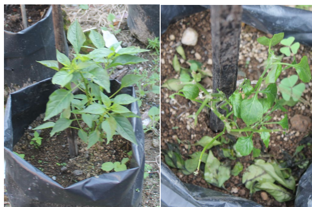
Figure 3. Chili plants 3 weeks after inoculated with Foc , introduced with B. thuringiensis strain ATCC 10792 (left) and control (right)

Besides, it had good ability to promote growth rate, all strains also had good ability to increase yields of chili pepper. All strains increase the yields with varied effectivity from 17.78 to 186.67%. Strains B. pseudomycoides strain NBRC 101232, B. thuringiensis strain ATCC 10792 and B. mycoides strain 273 respectively increase yields to 1.29 kg, 1.22 kg, and 0.99 kg compared to control 0.45 kg.