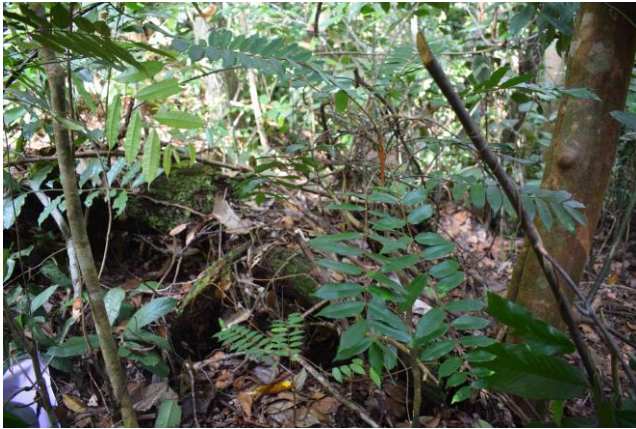
Figure 2. Eurycoma longifolia seedling grown near its harvested mother trees

Regardless of the effect of environmental and competition factors, this result was relevant to the conclusion that distribution pattern of plant species is usually clumped since the seeds fall close to their parents. According to Ashton (1969), the clumping of individuals of a species may be due to insufficient mode of seed dispersal. Okuda et al. (1997) also stated that clumped distribution of seedlings might be caused by lower number of seed and seedling predators and low species mortality rates. The clumped pattern of pasak bumi seedling is also related to seed dispersal and its reproductive system. Pasak bumi is dioecious plant, with male and female flowers, occur in different plants (Corner 1988). Male trees have sterile pistil and produce seeds that fall before maturity. Female trees are able to produce seeds but have sterile stamens. The pollination process occurs through cross-pollination and is probably mediated by insects (Padua et al. 1999).