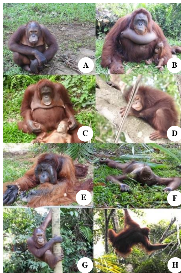
Figure 2. A. Sit-in posture, B. Sit-out posture, C. Sit-in out posture, D. Angled posture, E. Lateral lie posture, F. Back lie posture, G. Bimanual clinging posture, H. Unimanual forelimb clinging posture

Unimanual forelimb clinging (= arm hang). One of the orangutan hands grips the substrate with unusual support from other parts of the body (Figure 2.H). In this posture, more than half the body weight is supported by the forelimbs to grip a substrate above the body (Fleagle 1976; Thorpe and Crompton 2006).