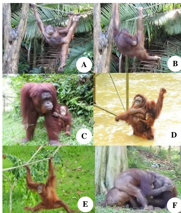
Figure 3. A. Contralateral forelimb-hindlimb suspend posture, B. Ipsilateral forelimb-hindlimb suspend posture, C. Quadrupedal stand, walk and run posture, D. Bipedal stand, walk and run posture, E. Brachiation posture, F. Multi-positional modes

Extended bipedal stand. In this stance, the hip and knee are completely expanded and not supported by the forelimbs (Figure 3.D). The trunk is near orthograde, and this position is described as human-like standing (Myatt 2011; Thorpe et al. 2007).