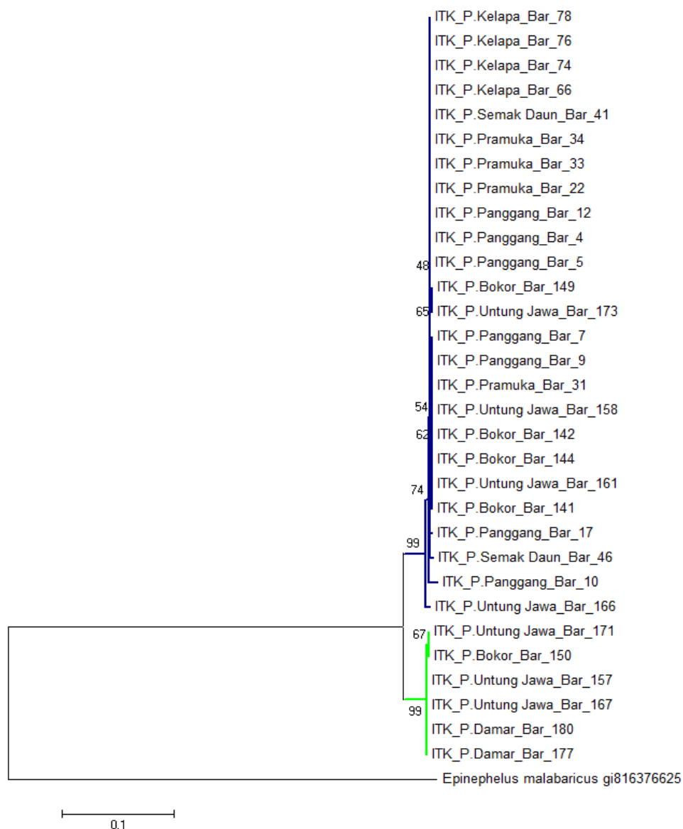
Figure 2 A Neighbour-Joining (NJ) phylogenetic tree reconstruction using 31 sequences of Siganus canaliculatus based on Kimura 2-parameter model and 1000 bootstrap replicates

The population Siganus canaliculatus on national park status zones (north) and south of Seribu Islands was significantly different, revealed by AMOVA analysis ( F_{ST} = 0.38 , p < 0.05 ) (Table 2). Gene flow associated with geographic isolation is affected by the geographical distance and the complexity of biodiversity (Wu et al. 2015). According to Mulyasari et al. (2010), population with a low level of differentiation that can be caused because of the many similarities between populations genetic element. The results obtained prove that among the population do not have so much in common genetic elements, and therefore make them vulnerable.