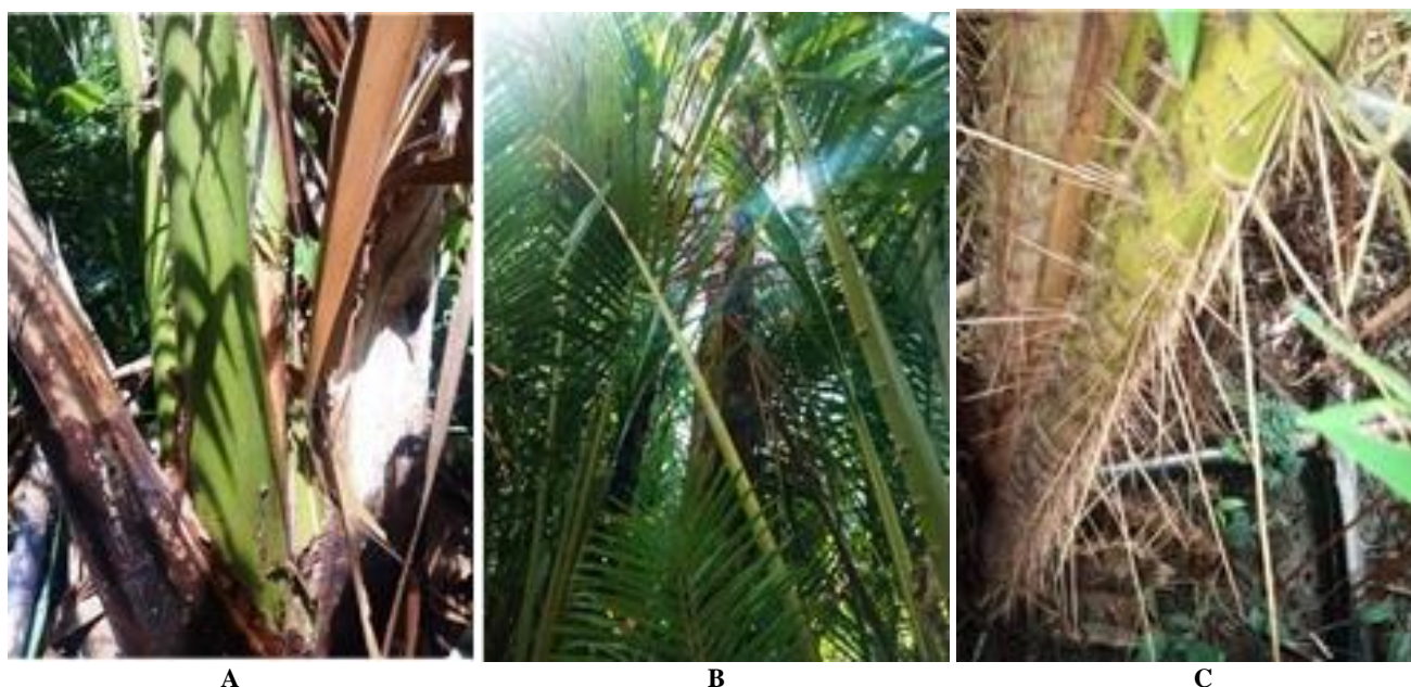
Figure 1. The three sago types: A. Spineless sago, B. Short spines sago, C. Long spines sago