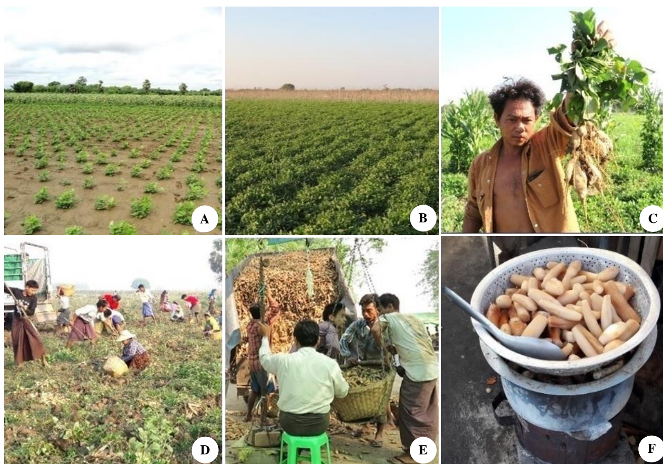
Figure 3. Winged bean is grown for its edible tubers in Tada-U Township, Mandalay Region, Myanmar in 2019. A. One month after planting, with low input sunflowers in the background. B. Nearing tuber maturity five months after planting, with high-input, trellised oriental melons in the background. C. Mature tubers uprooted from a winged bean field in which maize was planted at low plant density. D. Harvesting tubers at optimum stage five months after planting. E. Weighing baskets of freshly harvested tubers. F. Cooking tubers on a three-tiered oven, with hot coals below, steam-cooked intact tubers in the center, and hot, skinned, tuber snacks above.