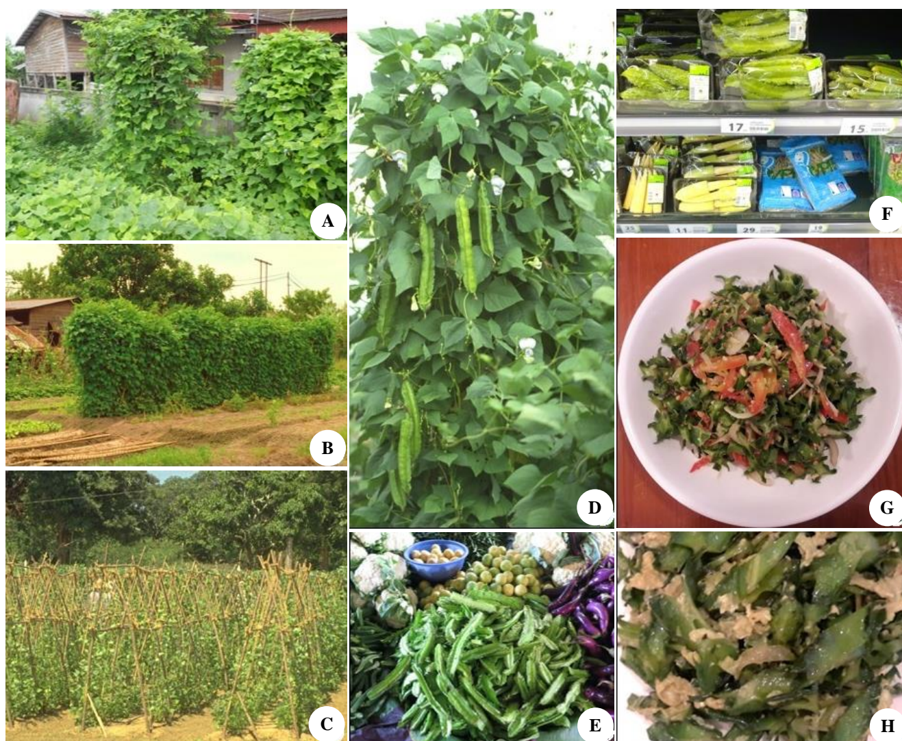
Figure 2. Winged bean is grown as an occasional fresh vegetable crop in most of Southern Asia. A. In rural household compounds (e.g., Khon Kaen, Thailand). B. In urban fringe settings as a local market crop (e.g. Selangor, Malaysia). C. In small, commercial-scale plantings (e.g., Sri Lanka). D. In urban backyards (e.g., Java, Indonesia); E. from which fresh pods may be sold in wet markets; F. or in modern supermarkets; G. to be eaten uncooked in salad dishes; H. or cooked in stir-fries and curries

The first written report of the cultivation of winged bean for its vegetable pods was that of Rumphius (1747) in the eastern Indonesian island of Amboina at the end of the sixteenth century. Rumphius considered that the plant was not indigenous to the island but had come from further west. Heyne (1927) compiled the limited information available at that time for winged bean cultivation in the archipelago, but it wasn’t until the mid-1970s with the work of Sastrapradja and colleagues (1975, 1978) in Bogor and of Thompson and Haryono (1980) in Jogjakarta that a comprehensive picture emerged of its cultivation in Java. More recently, Handayani et al. (2015), Kuswanto et al. (2016) and Yulianah et al. (2020) have expanded this picture with a genetic analysis of a wider range of cultivars from Indonesia, particularly East Java.