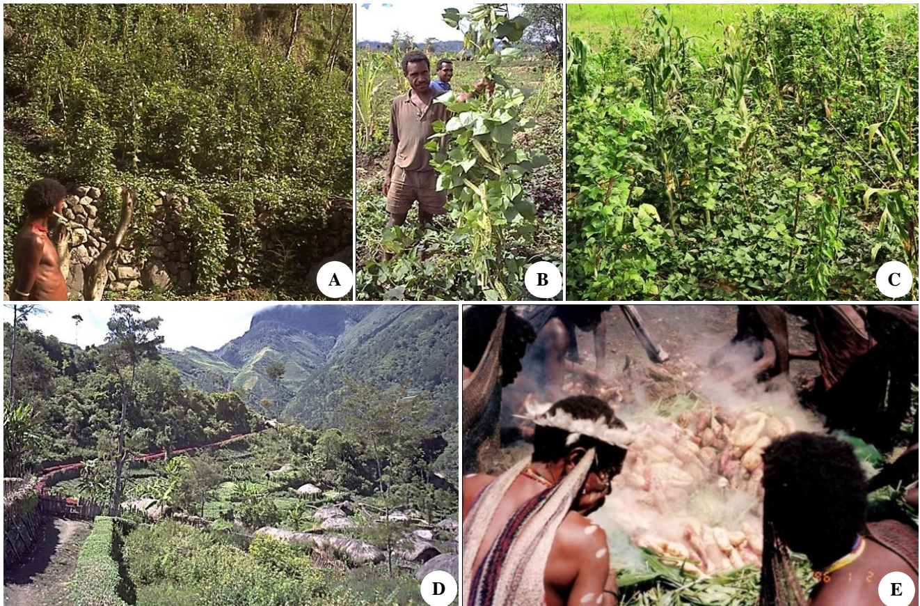
Figure 4. Winged bean along the Baliem valley in the vicinity of Wamena, capital town of Jayawijaya Regency, Papua Province, Indonesia. A. Near the valley bottom, a monocrop of winged bean grown with support of thin, woody, upright stakes on a rock-wall terrace, January 1996. B. Single supported winged bean clumps interspersed within a sweet potato crop. C. A spaced mixed garden crop of sweet potato, maize and winged bean December 2016. D. In villages on slopes up to about 1800 m, patches of winged bean occur in household compounds. E. Leafy shoots and full-length fresh pods are usually steam-cooked in a ground stone oven along with starchy root crops; the cooked winged bean seeds are usually plucked from the pod case and eaten whole.

Winged bean is rarely planted as a monocrop in the Baliem Valley, and then usually in fenced or terraced patches of less than 50 m 2 (Figure 4, image A). It is also rare to encounter it in sweet potato swamp fields. More commonly, it is grown in dryer fields ('tegalan' in the Indonesian language) in mixed plantings along with sweet potato, maize and taro; and in fenced slash-and-burn gardens of modest slope up to an altitude of about 1800 m asl.