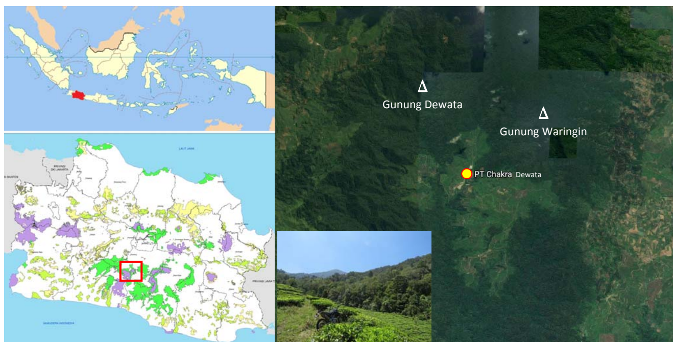
Figure 1. Research area in the Mount Tilu Nature Reserve, West Java, Indonesia. Insert: PT. Chakra Dewata tea plantation

The data were analyzed by using a diversity of species diversity index of Shannon Wiener (Magurran 1988), a community of species similarity index (Sorensen 1948). The use of space by virtue of the bird analyzed index (Natarajan and Jhingran 1961), and the use of selection space (Jacobs 1974).