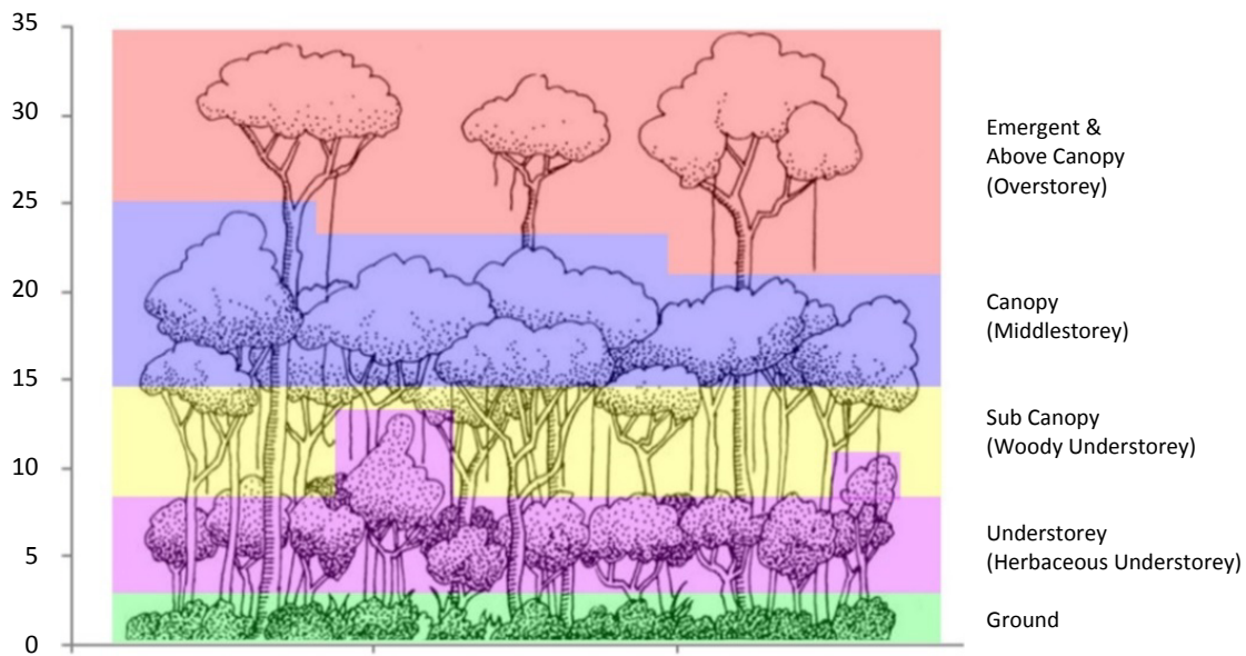
Figure 3. The space division layer of forest canopy in use by birds (Pearson 1971)