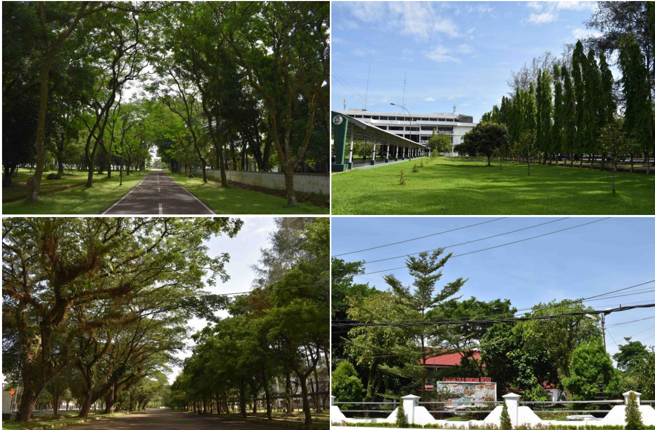
Figure 2. Some green space spots in USU Campus. Trees for aesthetics, pollutants absorber and another function planted along the street in campus

Among the 121 species, 70 were native species, 51 were exotic species from another tropical region. Exotic tree species are defined as species introduced to an area where they do not occur naturally. The proportion of exotic tree species from other continents consisted of introduced species from other parts of Asia (25 species), America (22 species), Australia (2 species) and Africa (2 species). The exotic tree planting was also found in Kediri City Park (Sulistiyowati and Yuantika 2019), Kupang city green space (Lestari et al. 2013), Mataram Merah Park (Simangunsong et al. 2021) and Karawang city (Heriyanto and Samsudin 2019). Another study conducted by Arifin and Nakagoshi (2011) found that among 19 species found in urban areas in several regions in Jakarta, only nine species were native to Indonesia. The species such as Cassia siamea , Polyalthia longifolia , Plumeria rubra , Swietenia macrophylla and Spathodea campanulata were commonly planted in Indonesian green space. Taxa originating from America and Asia also dominated the flora in Patras green space (Chronopoulos and Christodoulakis 2000), the Mediterranean green space (Quezel et al. 1990), and the central European region green space (Pysek et al. 1995). According to Riley et al. (2018) and Aronson et al. (2015), exotic tree species are common in many cities, and may influence the ecological and economic value of urban forests. Every exotic tree species is known for its good ability to adapt to harsh urban